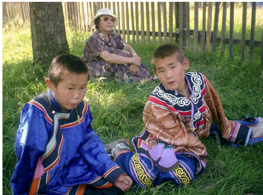
Udege children gathered