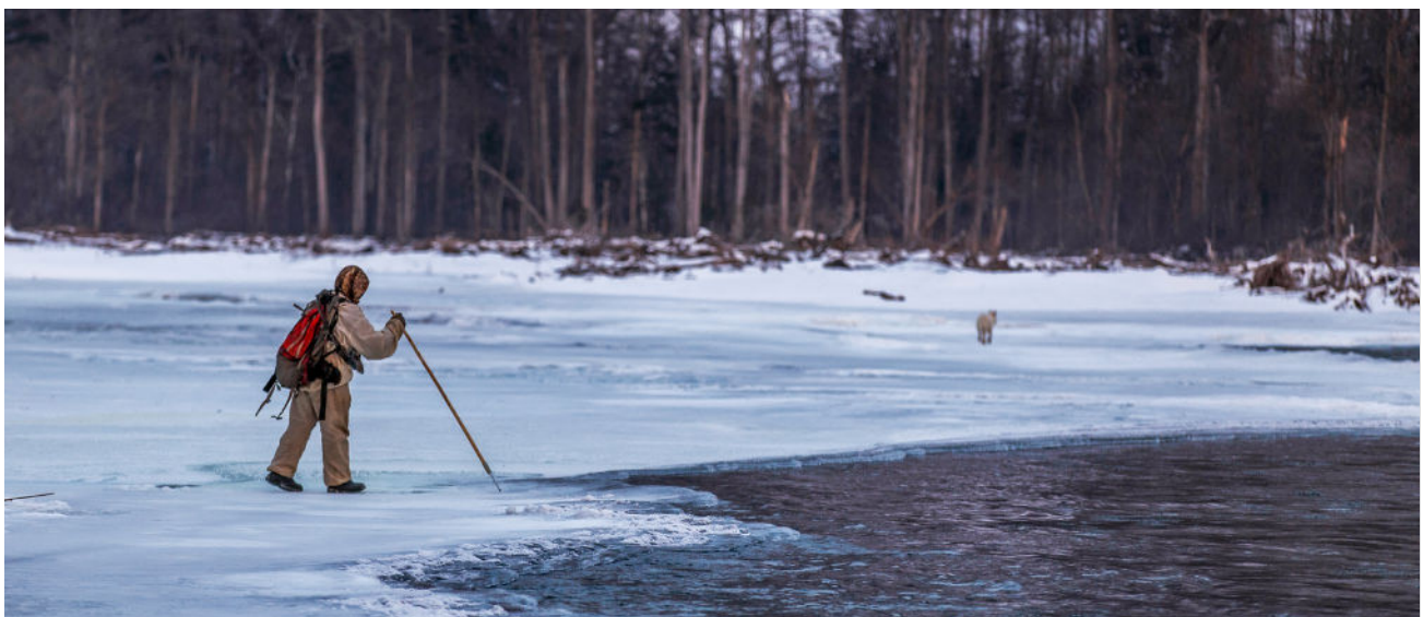
An Udege hunter stands at the edge of the ice on the river and tries its strength with a cane.

In all, the report is a call to action for a renewed commitment to protecting Indigenous Peoples' rights, including their freedom of religion or belief, and for nations to take concrete measures to address the challenges Indigenous Peoples face.