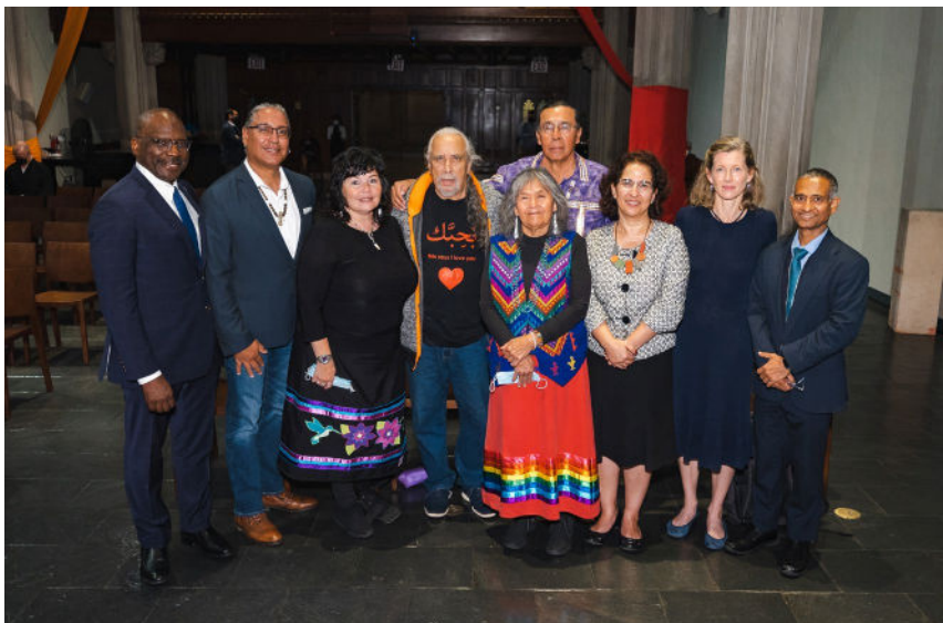
Speakers and participants gathered in James Chapel at Union Theological Seminary in New York City.

reciprocity. “The Original Instructions are our way of life,” she said. “In our sacred relationships, we must always remember that there is a balance that we must maintain.” The “practice of reciprocity” is central. “Give before you take. We take only what we need; we leave some for the rest.”