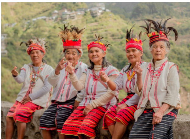
A group of women Ifugaos wearing traditional clothes, Banaue, Ifugao, Philippines.

On October 25, 2022, Ahmed Shaheed, who had just completed his term as United Nations Special Rapporteur on Freedom of Religion or Belief, presented the UN General Assembly with “Indigenous Peoples and the Right to Freedom of Religion or Belief,” a report that highlighted the significant challenges that Indigenous Peoples face globally in practicing their traditional spiritualities. The report cited “historical and ongoing experiences of discrimination, violence, and hostility, even threatening their spiritual, cultural, and physical survival,” often stemming from forced displacement, destruction of sacred sites, and restrictions on traditional ceremonies and languages. [3] The report emphasized the need for nations to protect and promote the right to exercise Indigenous beliefs freely, acknowledging that Indigenous Peoples’ land and ways of life are deeply intertwined in their spiritual traditions.