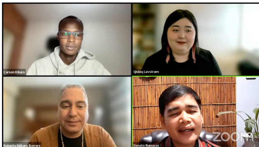
Speakers for Dialogue 2