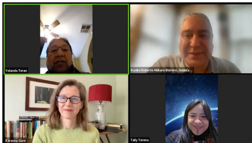
Speakers for Dialogue 4

“suffering” that results from this displacement. “They have denied access to our sacred places,” she said, “to the places where we need to go for praying, for meditating, for crying, for telling Mother Earth what is going on in our lives.”