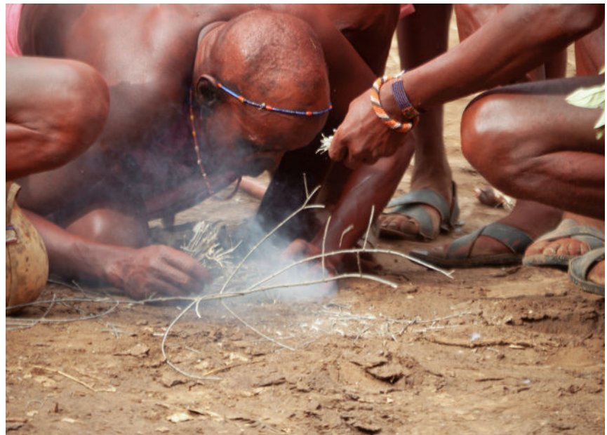
Men in ceremony in Kenya